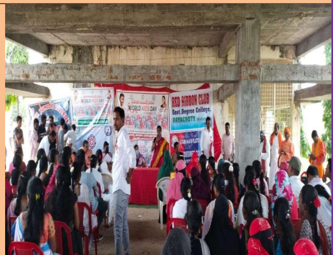
Gathering of the Students