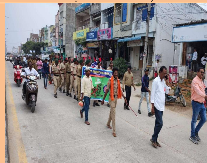
Rally on World AIDS Day