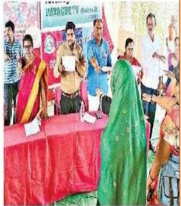
రాయచోటిలో ప్రతిజ్ఞ చేయిస్తున్న అధికారులు