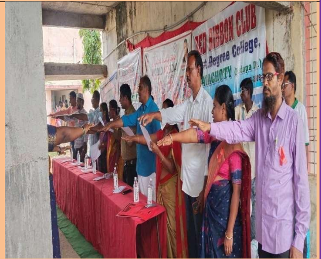
A Pledge for World Aida day