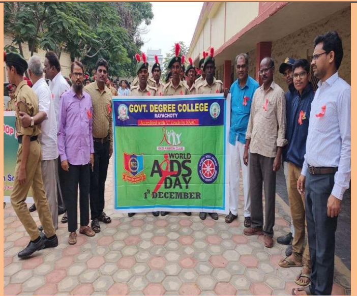
Rally on World AIDS Day