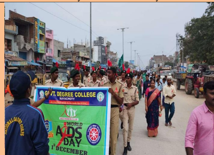
Rally on World AIDS Day