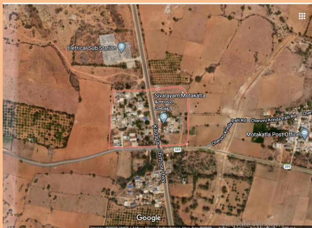
MAP FOR MOTAKATLA VILLAGE NEAR RAYACHOTY OF YSR DISTRICT

The aim of the NSS special camp is to educate the people and empower them. With this motto, the NSS UNIT comprising 49 students has organized a special camp at Motakatla Village, Sambapalli Mandal near Rayachoty of YSR district. The camp has been conducted under the supervision of college management and NSS program officer N. RAJA SEKHAR REDDY . The NSS team members divided among themselves into 5 groups and conducted a 7 days special camp in the Motakatla Village.