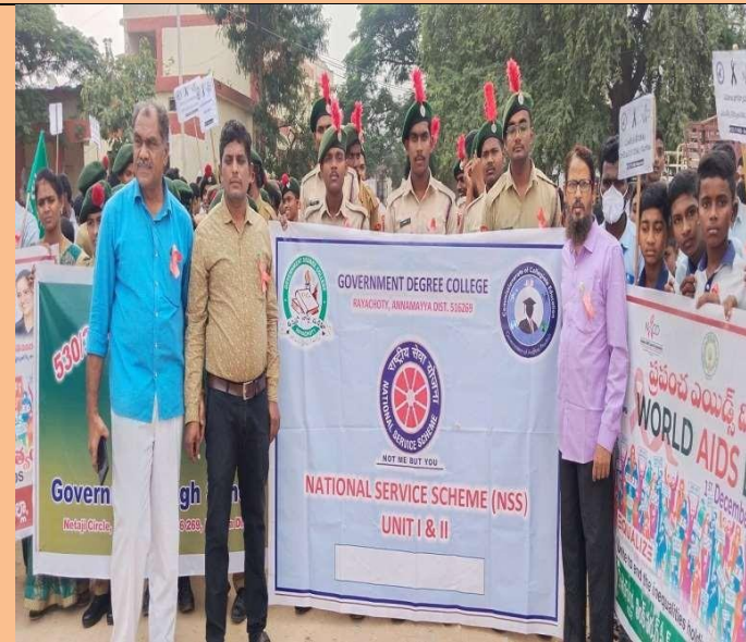
Rally on World AIDS Day