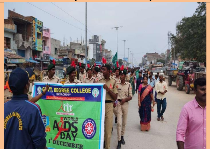
Rally on World AIDS Day